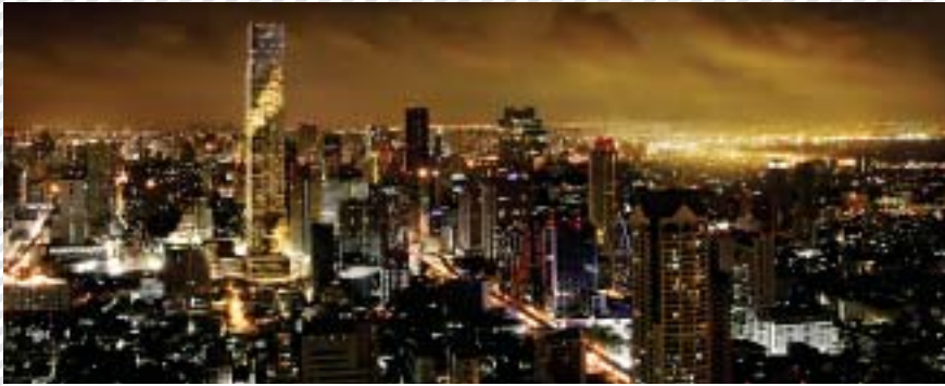
High End Residential : Mahanakhon - Thailand (Bouygues Thai)

The synergy between all its businesses allows Bouygues to take on complex multi-disciplinary projects successfully anywhere in the region.