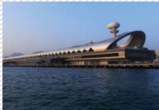
Transport Infrastructure : Kai Tak Cruise Terminal - Hong Kong